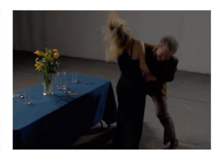
Untitled (After Violent Incident), 20XX