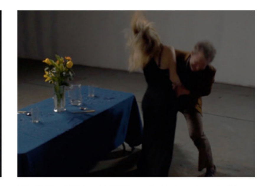
Untitled (After Violent Incident), 20XX