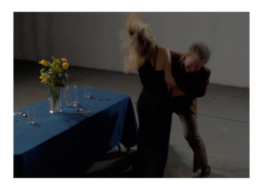
Untitled (After Violent Incident), 20XX