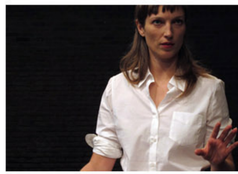
Although We Fell Short, 20XX