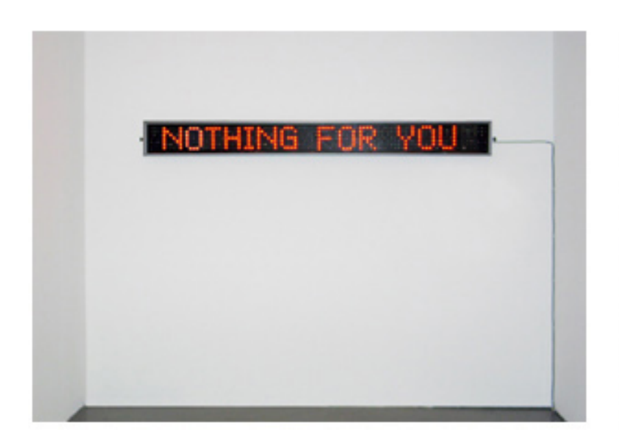
Nothing List, 2006