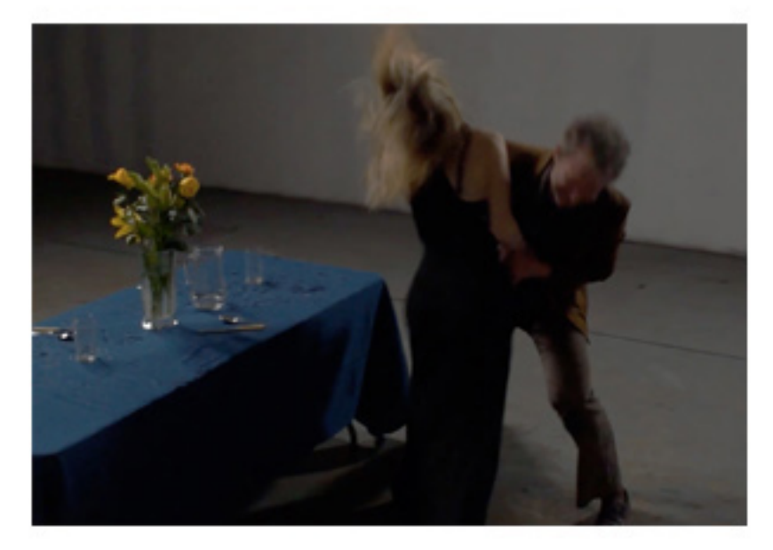
Untitled (After Violent Incident), 20XX