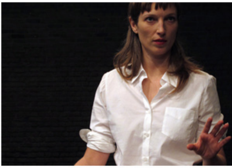
Although We Fell Short, 20XX