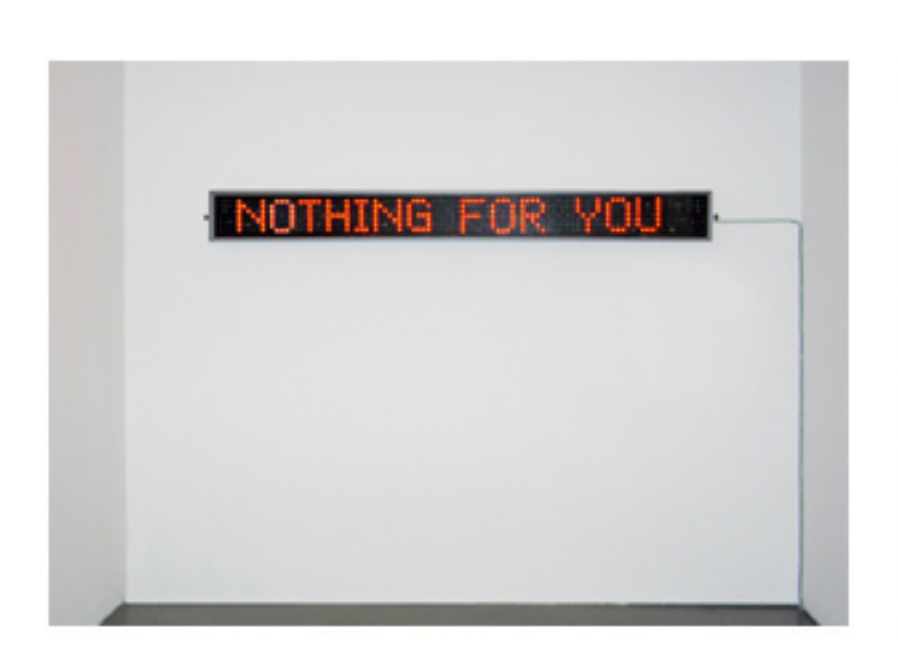
Nothing List, 2006