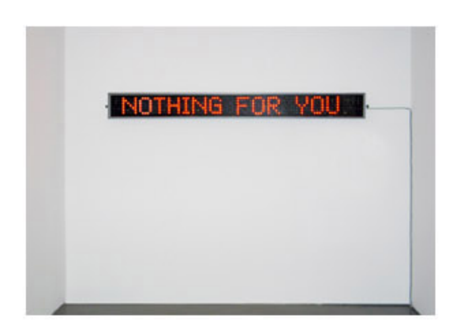
Nothing List, 2006