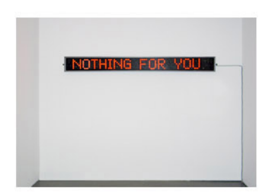
Nothing List, 2006