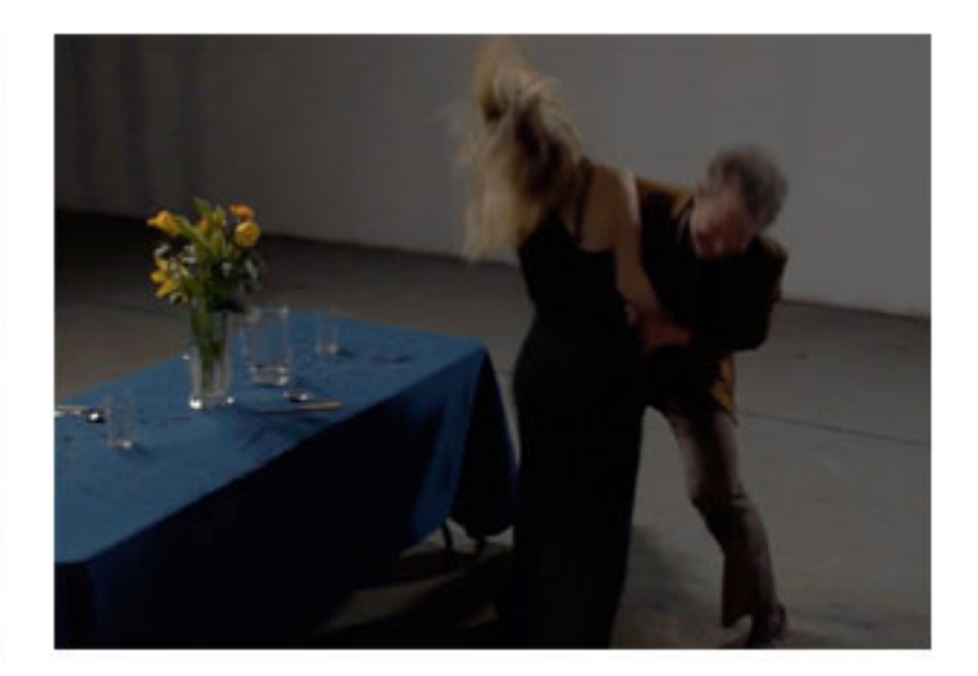
Untitled (After Violent Incident), 20XX