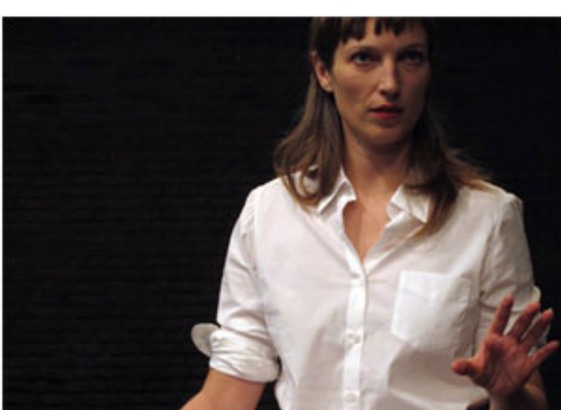
Although We Fell Short, 20XX