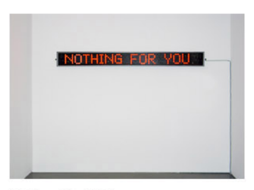
Nothing List, 2006

2015 | 2014 | 2013 | 2012 | 2011 | 2010 | 2009 | 2008 | 2007 | pre 2007