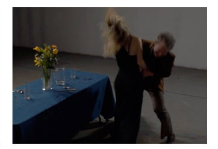
Untitled (After Violent Incident), 20XX