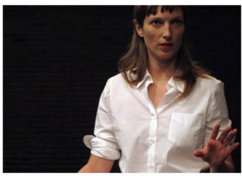
Although We Fell Short, 20XX