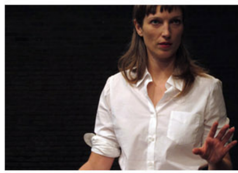
Although We Fell Short, 20XX