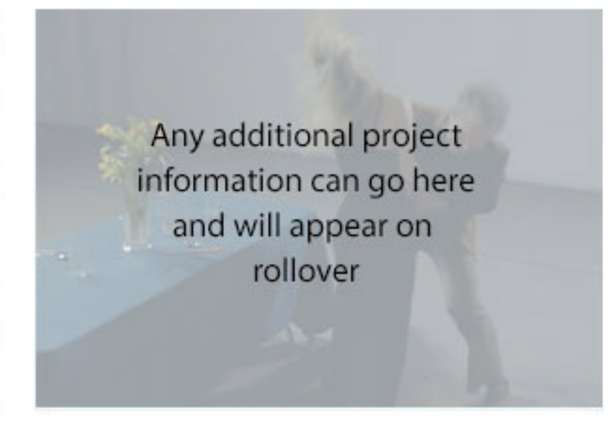
Untitled (After Violent Incident), 20XX