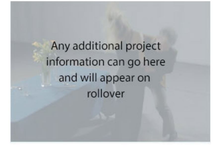
Untitled (After Violent Incident), 20XX