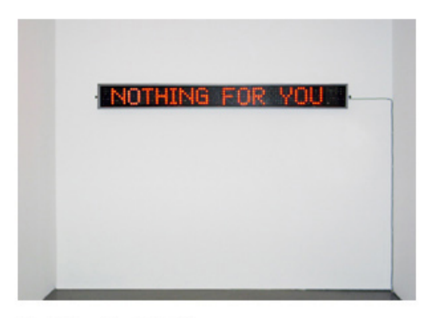
Nothing List, 2006