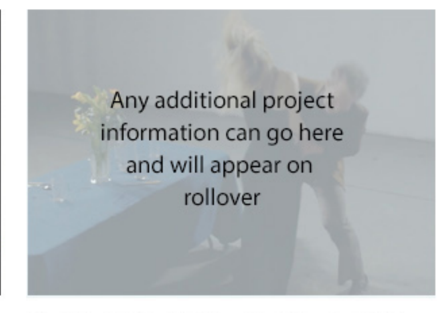
Untitled (After Violent Incident), 20XX