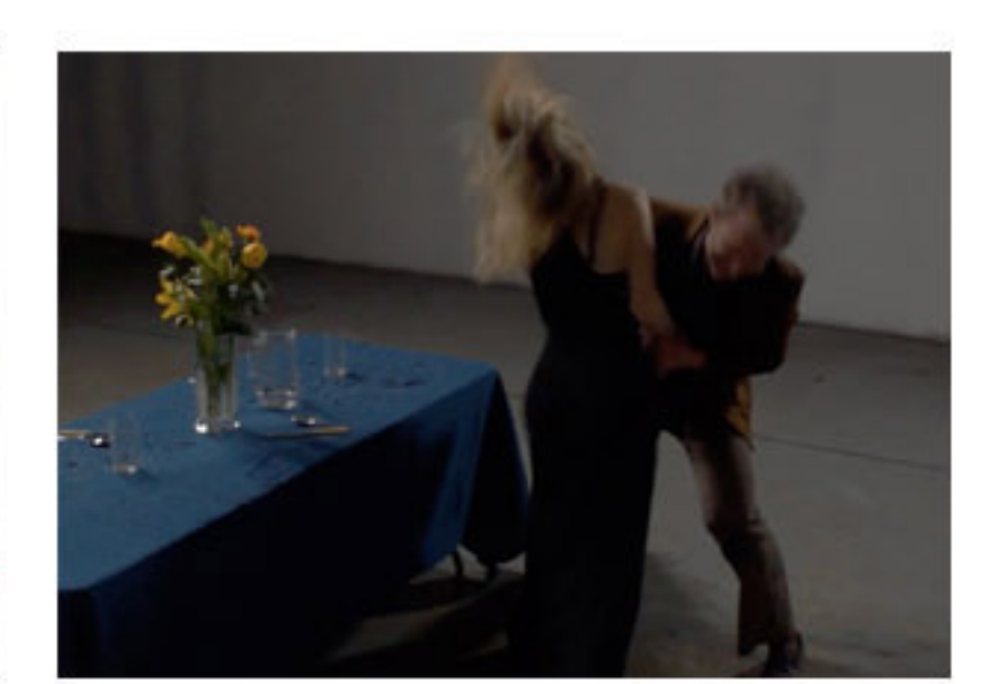
Untitled (After Violent Incident), 20XX