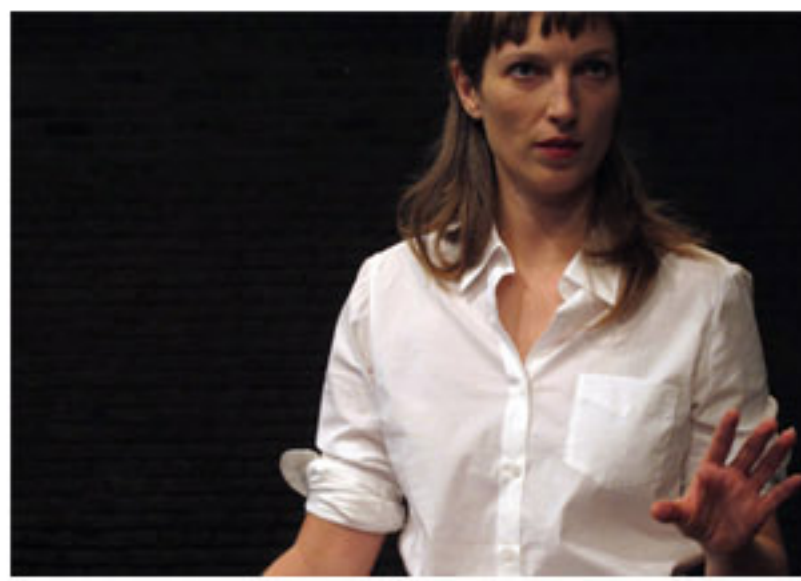
Although We Fell Short, 20XX