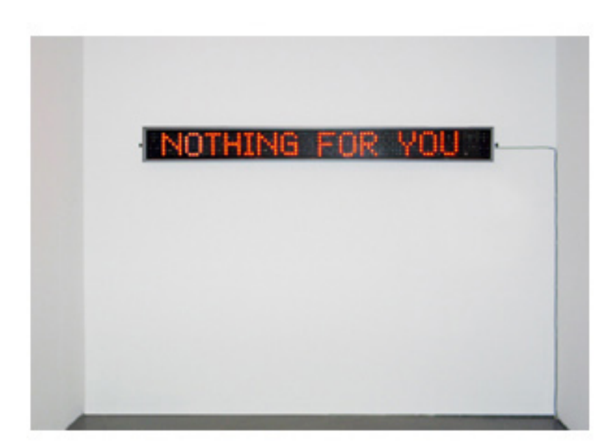
Nothing List, 2006