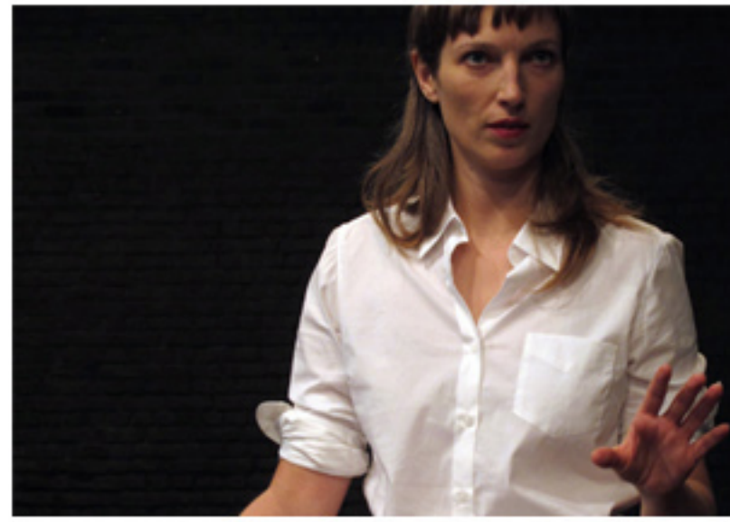
Although We Fell Short, 20XX